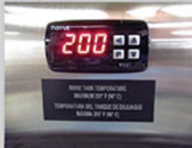
8. Make sure rinse tank temperature reaches 200 F (96 C).