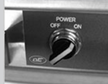
4. Turn power switch to 'on' and close door.