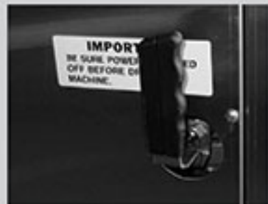
2. Open drain valve and drain machine completely.