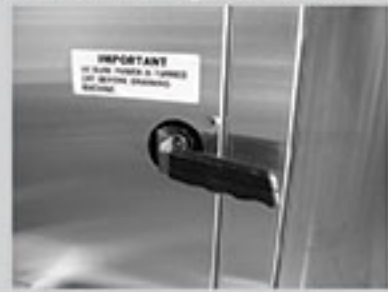
1. Close drain valve. Left side of pan washer.