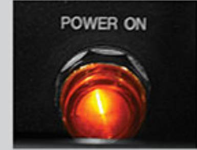
6. Amber light will illuminate when water level is reached.