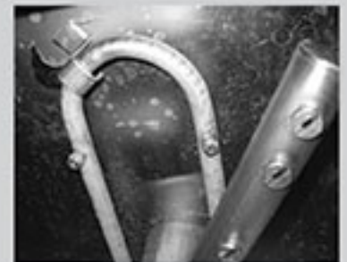
7. Wash and rinse nozzles must be inspected for blockage and cleaned.

6. Clean wash tank and inside of machine entirely with spray gun and hose.