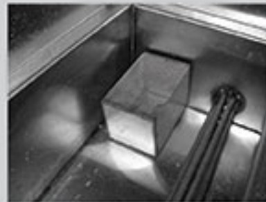
2. Place pump inlet screen in position-left rear corner of wash tank.