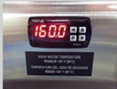
7. Wait until wash temperature reaches 155-160 F (68-71 C).