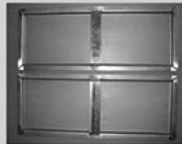
3. Scrap trays must be removed and cleaned thoroughly.