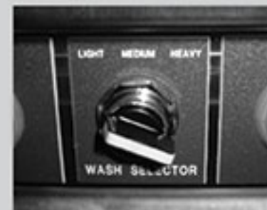
10. Turn wash selector to desired setting. (Light/5 min. Medium/7 min. Heavy/9 min.)