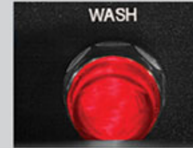
12. When wash light goes off, cycle is complete.

SPECIAL NOTE: DOOR MUST BE SHUT AT ALL TIMES TO OPERATE MACHINE AND PREVENT HEAT LOSS!