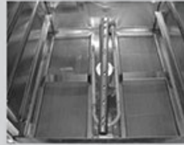
3. Position scrap trays in proper place.