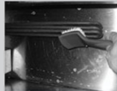
4. Brush residue from immersion heaters daily. Electric models only.