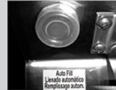
5. Push Fill button to fill wash tank.