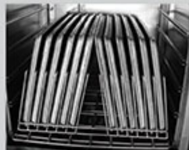
9. Load pans into rack; make sure papers and large food items are removed before loading pans!