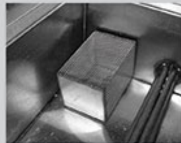
9. Replace pump inlet screen and clean inside of machine entirely with hose and brush.

DO NOT ALLOW ANY FOREIGN MATERIAL TO ENTER PUMP INLET!! NOTE: Final inspection should be carried out for any build-up residue. Entire machine must be clean before installation of scrap trays and filling with water.