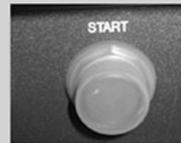
11. Press "start" button. Washlight should illuminate red.