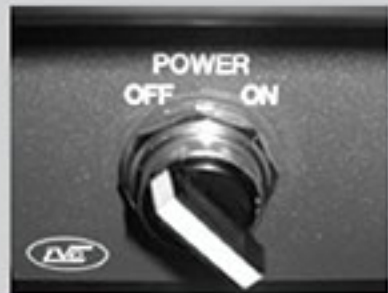
1. Turn power switch "OFF"