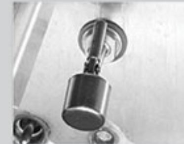
5. Carefully clean residue from level sensor daily.

6. Clean wash tank and inside of machine entirely with spray gun and hose.