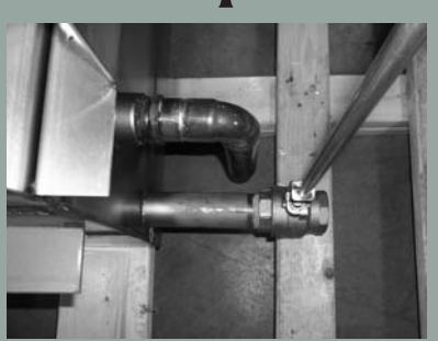
1. Close drain valve. (Skip this step with Auto Drain option.)