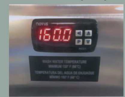
7. Wait until wash temperature reaches 155-160 F (68-71 C).