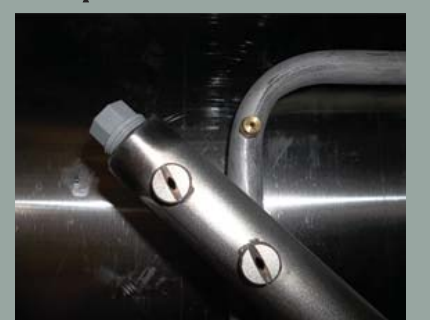
6. Wash and rinse nozzles must be inspected for blockage and cleaned.

5. Clean wash tank and inside of machine entirely with spray gun and hose.