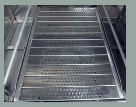
8. Replace pump inlet screen, scrap trays, and floor grates.