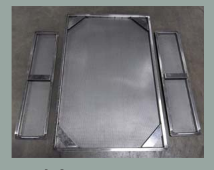
2. Scrap trays must be removed and cleaned thoroughly.