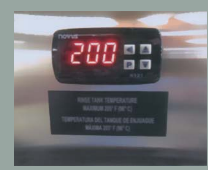
8. Make sure rinse tank temperature reaches 200 F (96 C).