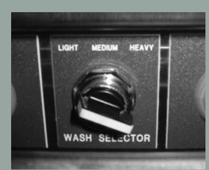
10. Turn wash selector to desired setting. (Light/5 min.