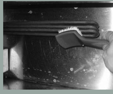
3. Brush residue from immersion heaters daily. Electric models only.