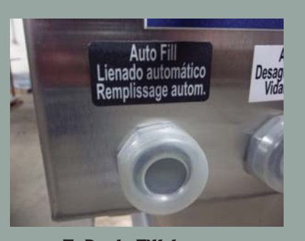
5. Push Fill button to fill wash tank.