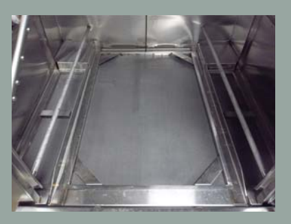
3. Position scrap trays in proper place and put floor grates in washer.