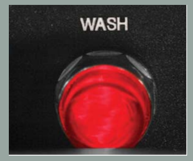
12. When wash light goes off, cycle is complete.