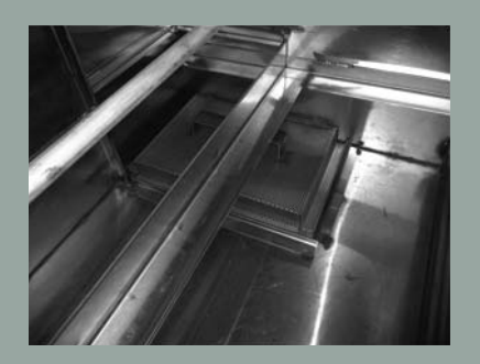
2. Place pump inlet screen in position-left rear corner of wash tank.