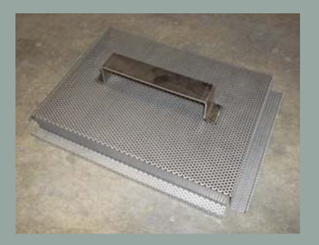
7. Pump inlet screen must be removed and cleaned thoroughly.