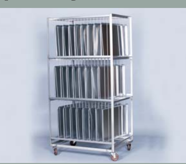
9. Load pans into rack; make sure papers and large food items are removed before loading pans!