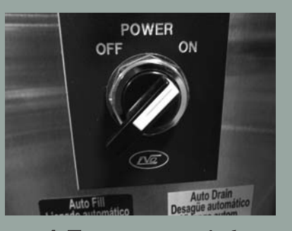
4. Turn power switch to 'on' and close door.