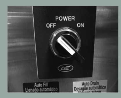
1. With Auto Drain: Push the auto drain button then wait 10 seconds and turn off the power switch. Without Auto Drain: Turn off power switch and open the drain valve.